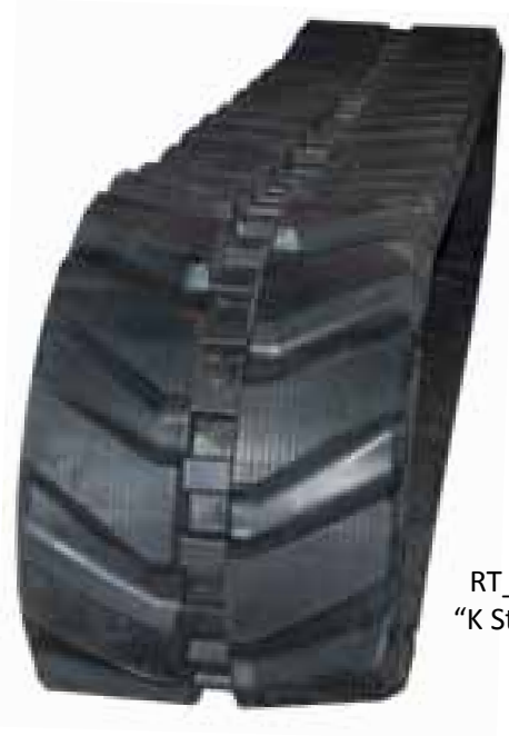
RT_23 "K Style"

Check with your sales representative for more options.