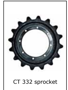
CT 332 sprocket