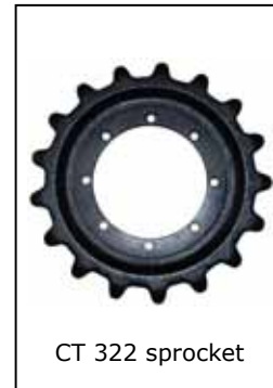
CT 322 sprocket